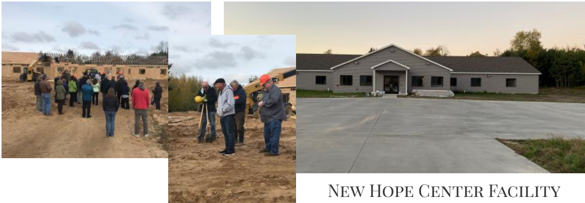
NEW HOPE CENTER FACILITY

"Truly I tell you, whatever you have done to the least of these brothers and sisters of mine, you did for me." Matthew 25:40